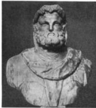
Bust of Kronos