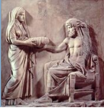
Cronus being handed a rock in Zeus's clothing