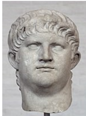
Nero, Glyptothek, Munich