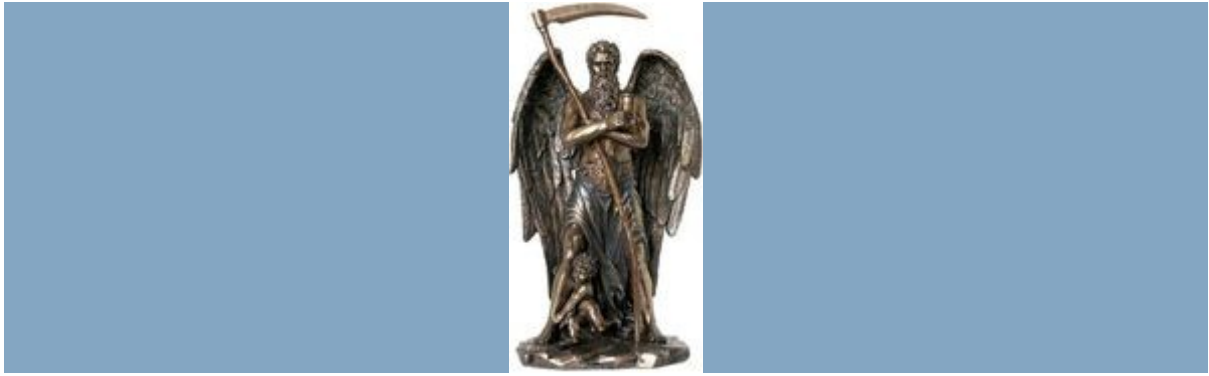
Bronze Sculpture of a winged Kronos King of Titans