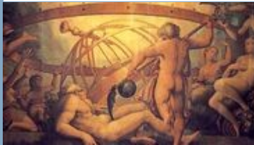
Kronos & Ouranos