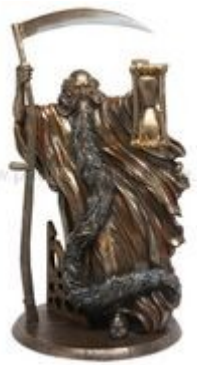
Bronze Sculpture of Kronos King of Titans Lord of Time (Identifiable by his Scythe and hourglass)