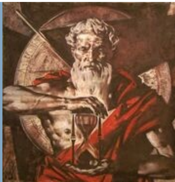
Depiction of Kronos (identifiable because of the hourglass in his hand representing time).