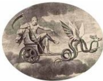
Kronos flying in a chariot led by flying Drakons